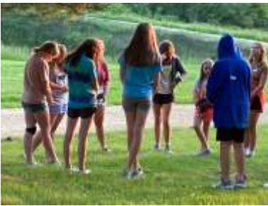
CONFIRMATION CAMP June 12-17 at Sugar Creek