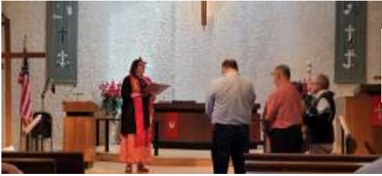
COUNCIL INSTALLATION June 5